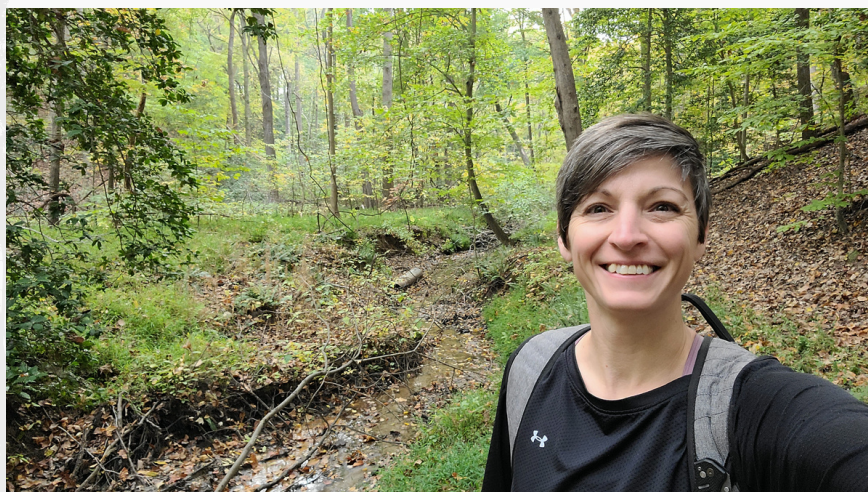
Hiking the trails at Maxwell Hall Park in Charles County