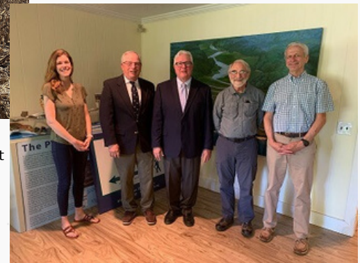
Settlement of easement on the Yoe property in Calvert County, now owned by American Chestnut Land Trust and soon to be open to the public