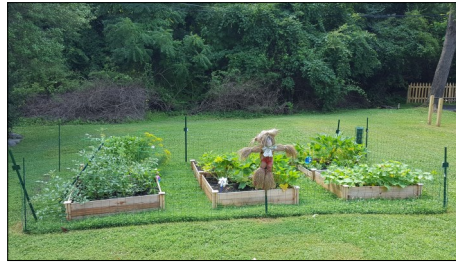
Supplies and materials provided for the Child, Inc. youth garden. The pandemic delayed completion of the project until spring 2021.