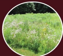
Springer Woods Pollinator Meadow