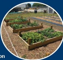
Milford Community Garden