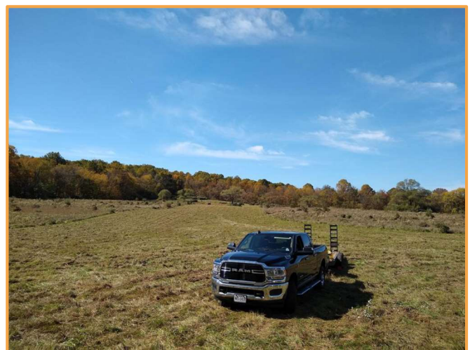
18 acre 2021 planting site in Washington County owned by C&O Canal NHP (Potomac River Watershed)